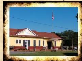
Osage County Historical Museum