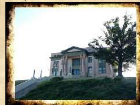
Osage County Courthouse