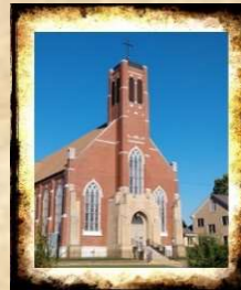
Immaculate Conception Church